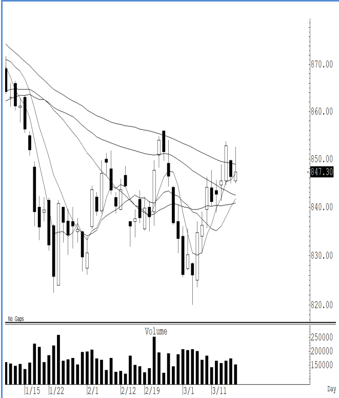
S50H24 (Close 847.30 Chg 1.0)